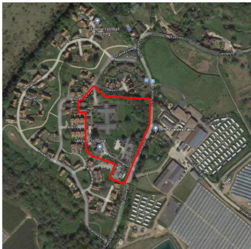
Milford Hospital Site (bound in red) in context

As previously identified, the site is currently located within the Green Belt, but due to the existing built form would represent previously developed Green Belt land. Similarly, the surrounding context has changed significantly in recent years, with the introduction of significant new built form to the north, west and south of the site in the form of new residential dwellings. The site is also grouped adjacent to large agricultural buildings to the east across Tuesley Lane.