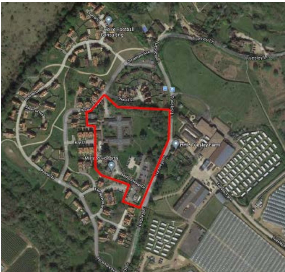
Figure 2 Milford Hospital Site in context

The site is currently located within the Green Belt, but due to the existing built form would represent previously developed brownfield land, with considerable existing built footprint. Similarly, the surrounding context has changed significantly in recent years, with the introduction of significant new built form to the north, west and south of the site in the form of new residential dwellings. The site is also located adjacent to the large agricultural buildings at Tuesley Farm to the east.